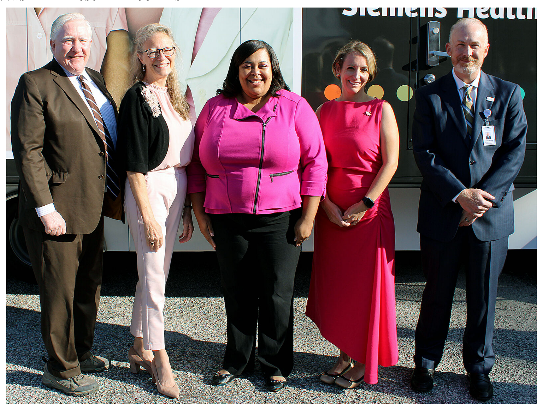
LANNWS-10-07-23 MUSC MAMMOGRAMS 4