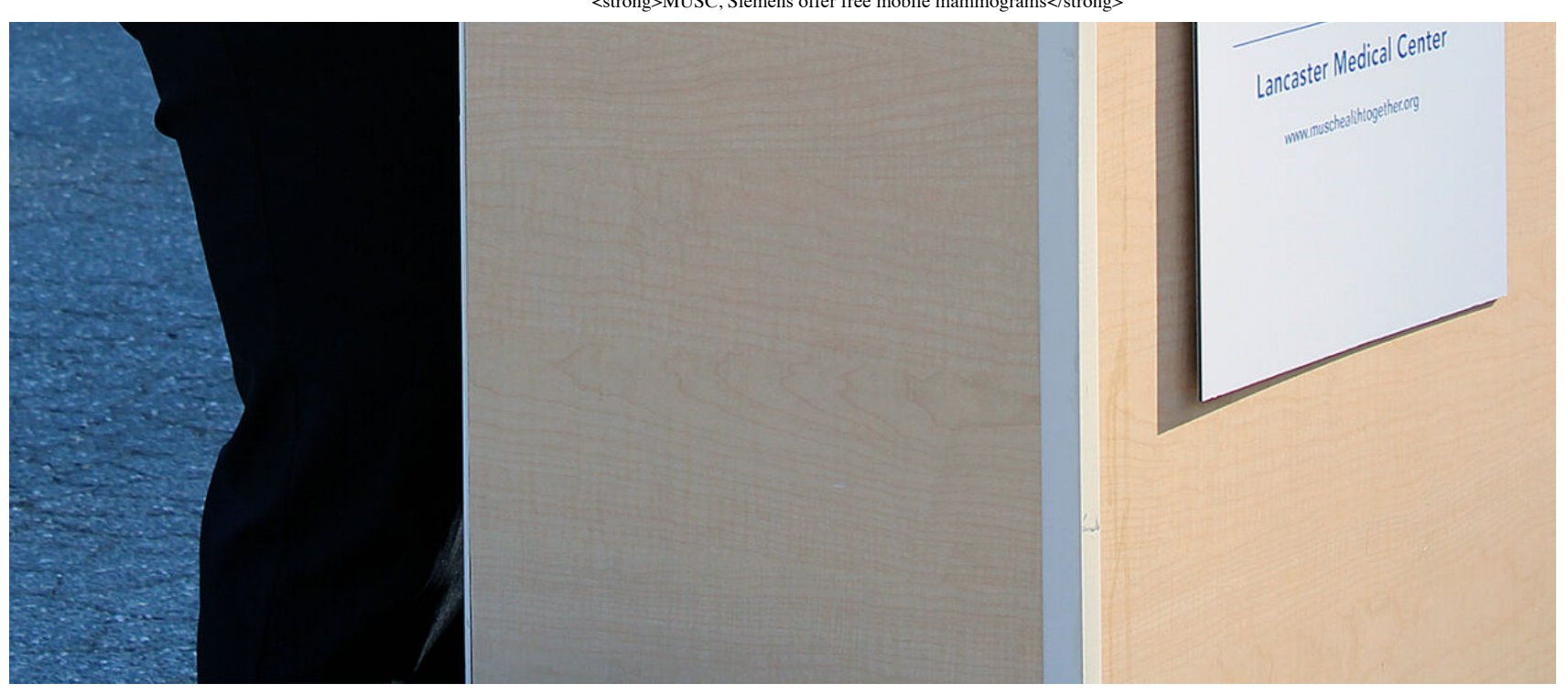
LANNWS-10-07-23 MUSC MAMMOGRAMS 2