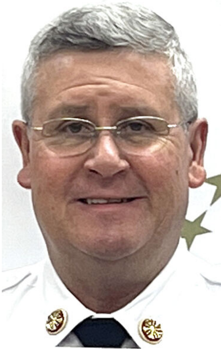
LANNWS-06-10-23 FIRES 1